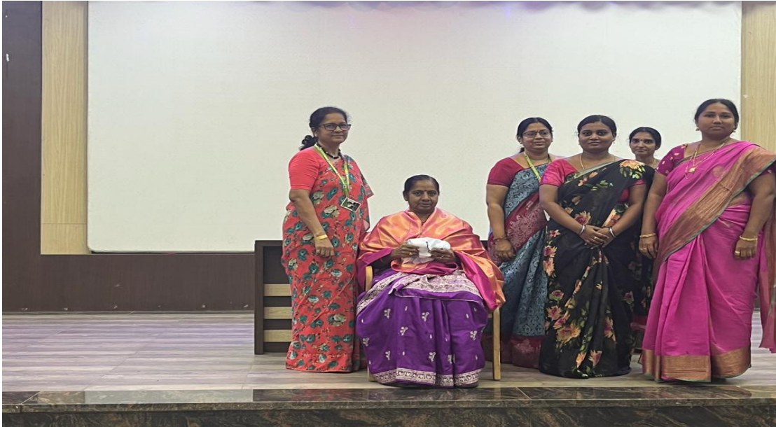
Felicitation to resource person