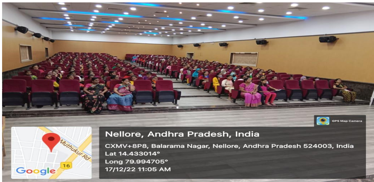
Audience listening to the speech